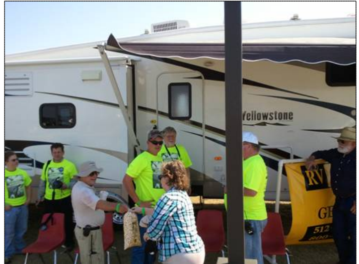
TARC members hanging out at the Temple Air Show